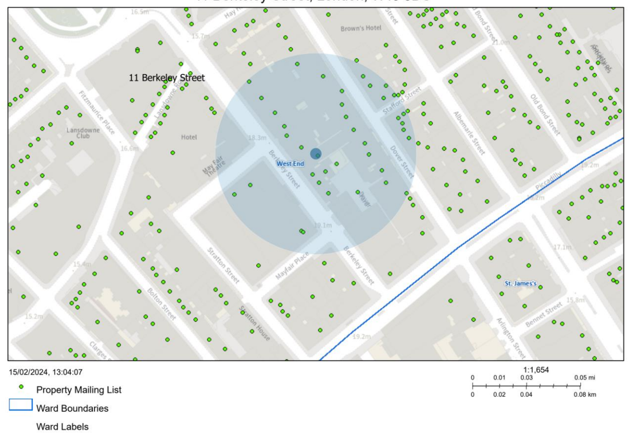
11 Berkeley Street, London, W1J 8DS